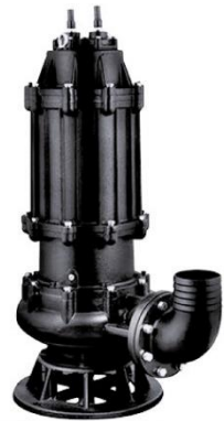
WQ 11 – 45 Kw