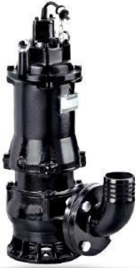
WQ(D)0.75 – 7.5 Kw